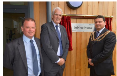
Jubilee House opening