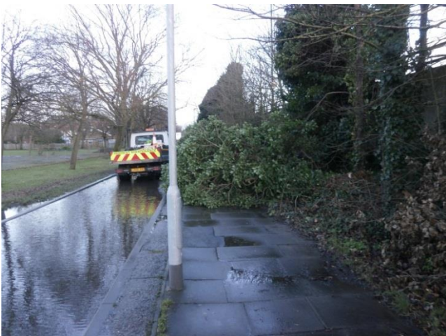
A tree went down in Park Road, Hanworth.

A second event on 27 December 2013 involved a tree (approx. 50 ft) leaning towards private properties on Swinfield Close. The tree from a private property posed a risk to adjacent homes and a private road. The Hounslow Highways grounds maintenance officer attended site (1400 hours) and was requested by the home owner to remove the tree immediately as efforts to contact private contractors had been unsuccessful. Hounslow Highways' called on site and removed the tree by 1700 hours.