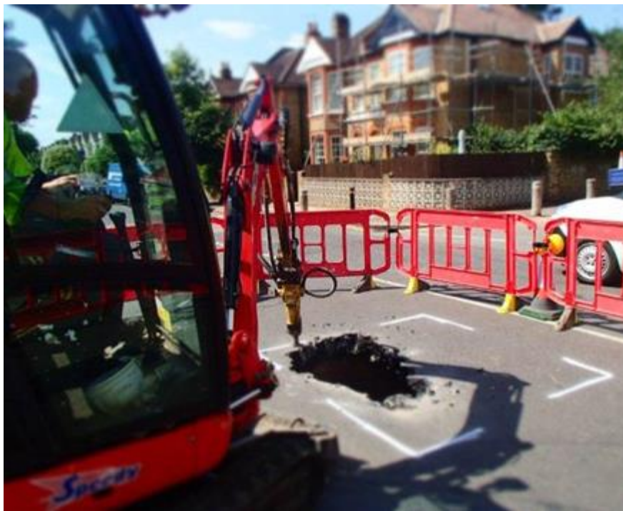
The hole was caused by a collapsed sewer more than five metres underground.