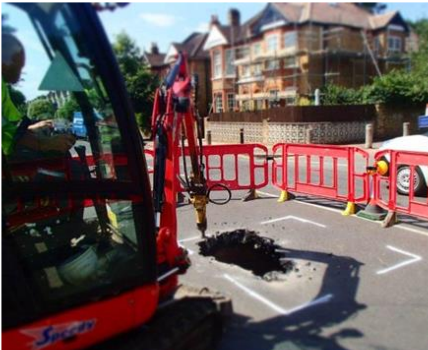
The hole was caused by a collapsed sewer more than five metres underground.